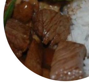
Table Lobby Menu