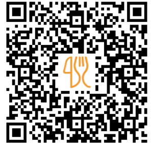
Table Lobby Menu

https://menulist.menu 71 Brougham St, New Plymouth, New Zealand http://www.nicehotel.co.nz/