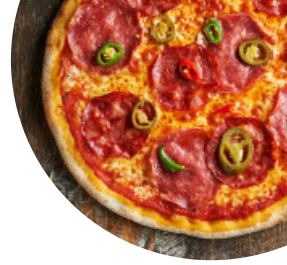
Fig Tree Menu