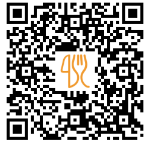
Fig Tree Menu