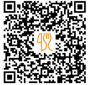
Fig & Olive at Cowes Menu