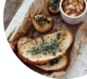
Fig & Olive at Cowes

Phillip Island, 115 Thompson Ave, CRIB POINT, Australia