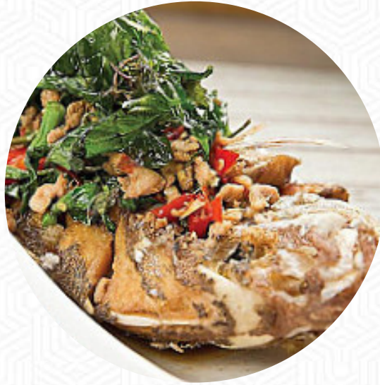
Abb Air Thai Menu